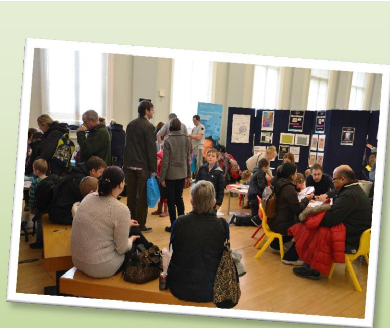
Brain Awareness week at the World Museum 16 th March 2013

If you want to find out more about the studies and get involved, then please call us on 0151 7059649 or email at encephuk@liverpool.ac.uk